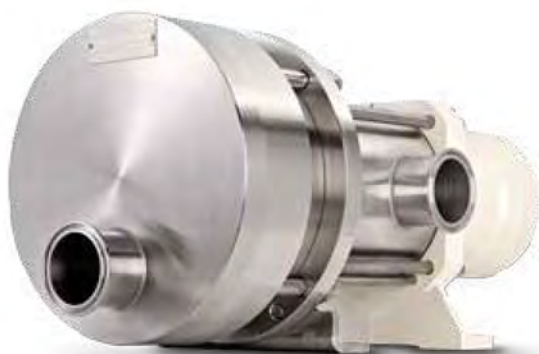
C Series Eccentric Disc Pump