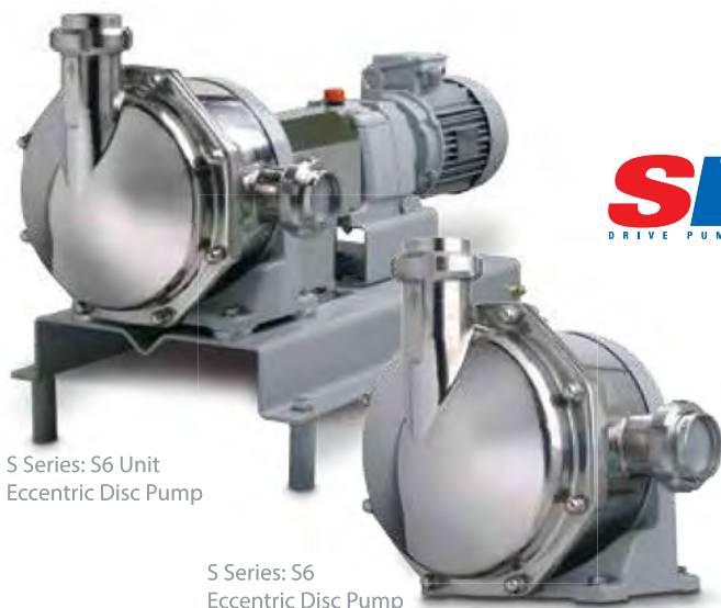
S Series: S6 Unit Eccentric Disc Pump