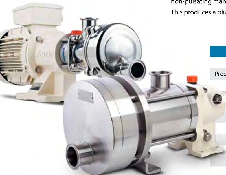
Product-Recovery Costs Saved Per Eccentric Disc Pump

The pump technology that can best optimize product recovery is positive displacement eccentric disc pump technology from Mouvex®. Mouvex eccentric disc pumps are able to do this because they can pump air, which creates a vacuum effect on the pump’s suction side and a compressor effect on the discharge side. In other words, once the product runs out in the feed tank, the Mouvex technology continues to pump air in a very constant, non-pulsating manner so that the surface tension on any remaining fluid is not broken. This produces a plug effect, which pushes out the product “plug” as a whole.