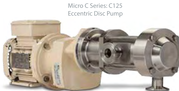
Micro C Series: C125 Eccentric Disc Pump