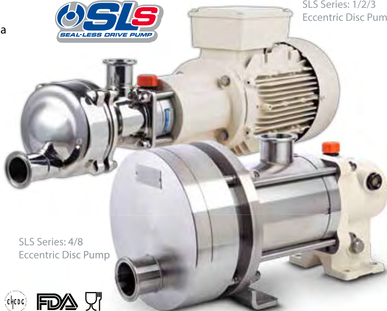
SLS Series: 4/8 Eccentric Disc Pump